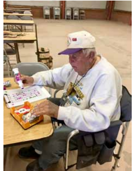
Had another good round of Bingo at La Paz.