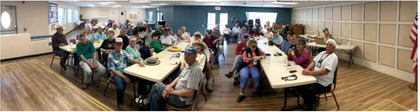
The General Meeting held indoors out of the weather. Lots of wildflowers in the area made for great viewing and many of us visited the local restaurants.