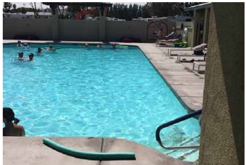
One of the refreshing Spas at Catalina.