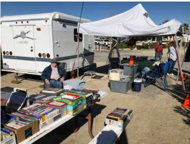
We had a little wind problem which broke our tent