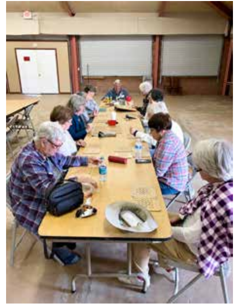
Had another good round of Bingo at La Paz.