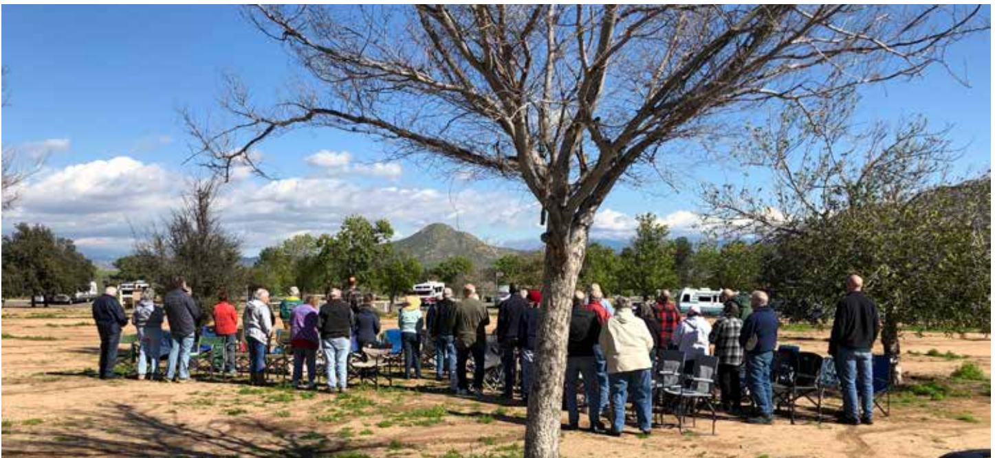
General Meeting singing God Bless America