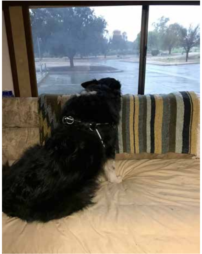
Is this rain ever going to stop?