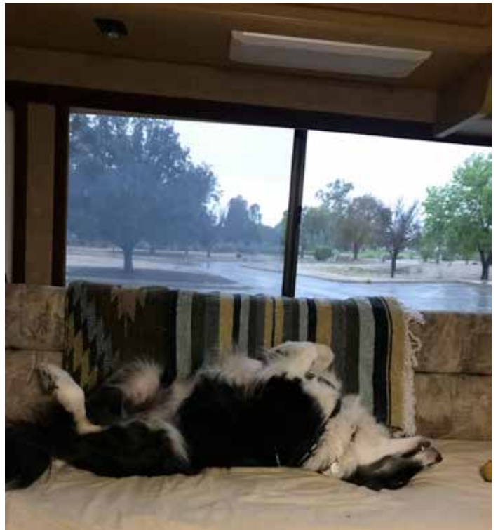
I can't take it anymore!