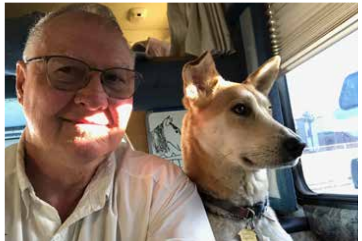
Hanging out in the RV!