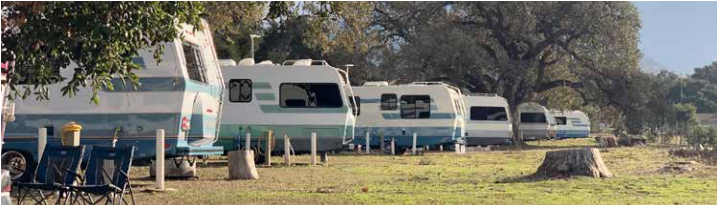
Beautiful setting for a wonderful Caravan