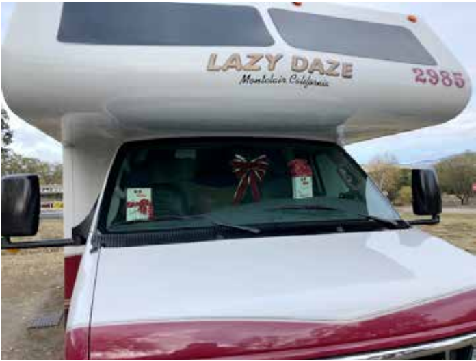
Decorating for Christmas