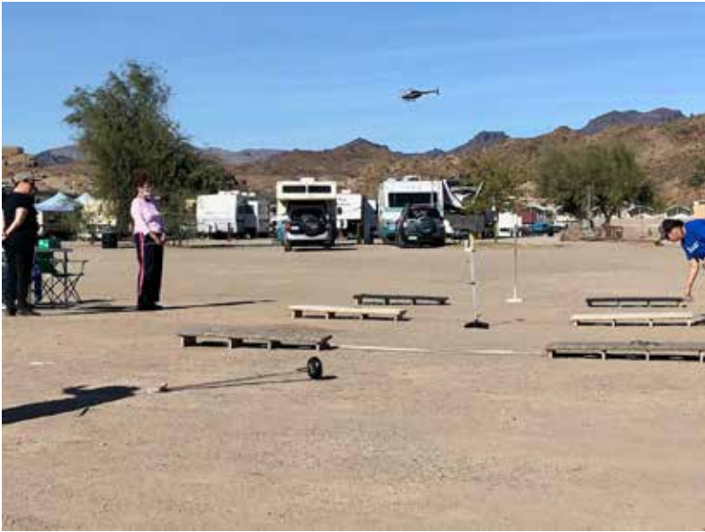
The Sheriff helicopter patrolled all week.