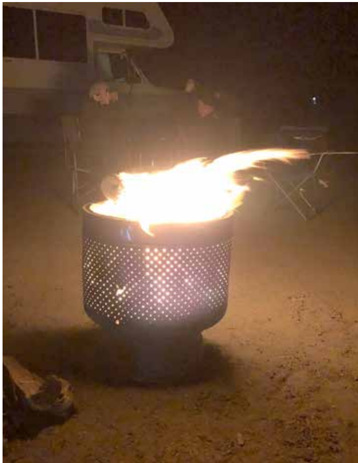
It was a bit windy at Parker. Some of us wore masks just to keep the sand and dirt out of our teeth!