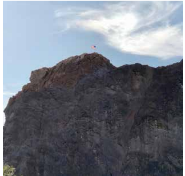
The flag gave us wind direction.