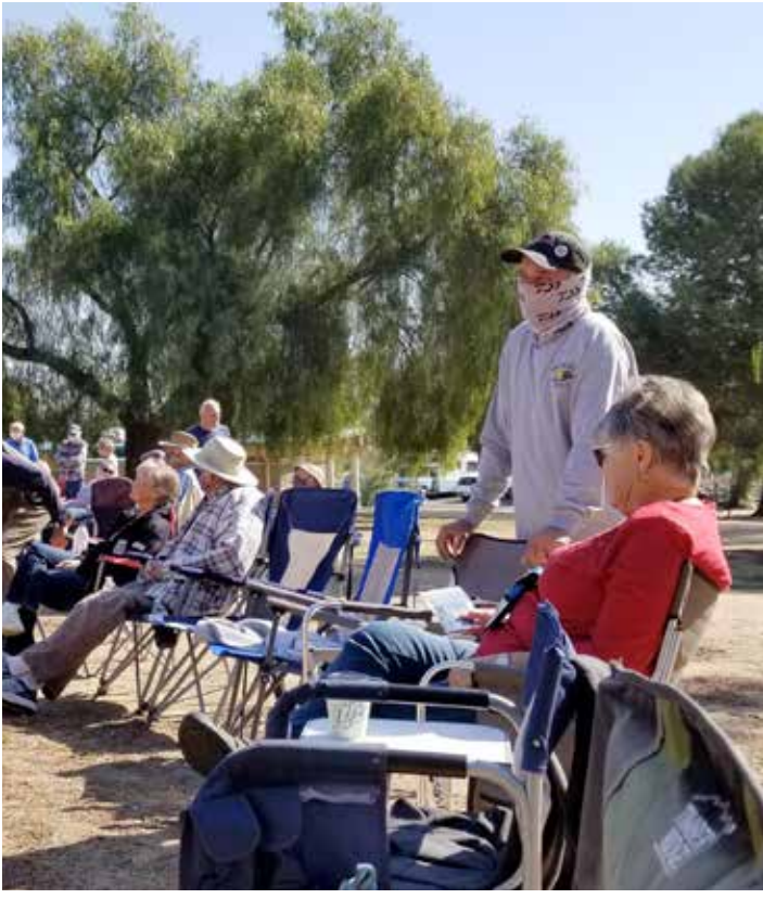
Washer Toss is still draws a lot of spectators