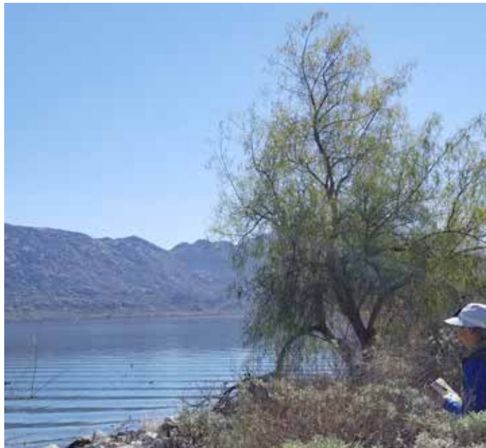
Lake Perris