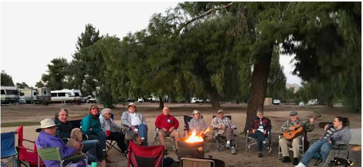
Some singing around the campfire