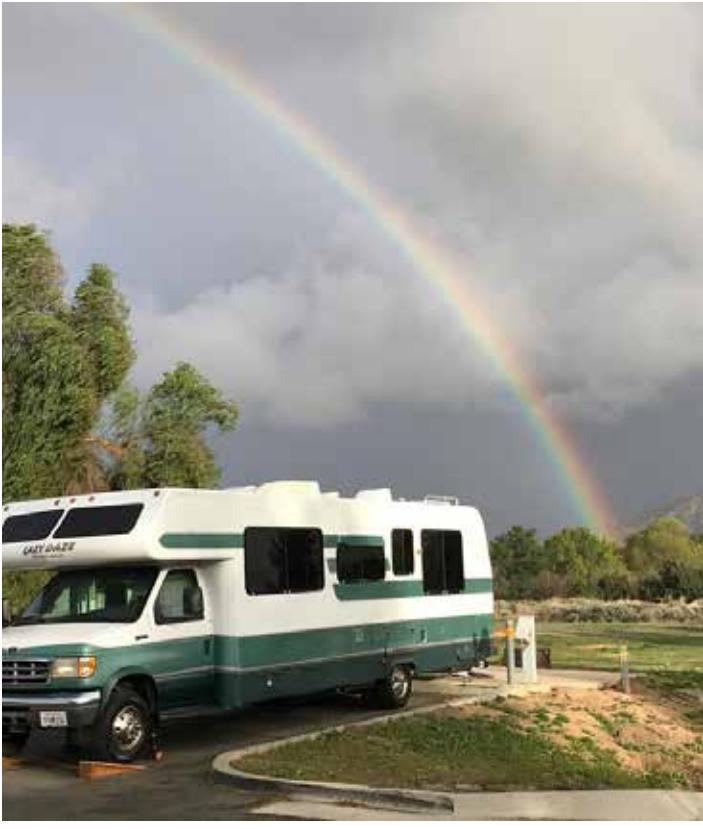
Rainbow at Lake Perris