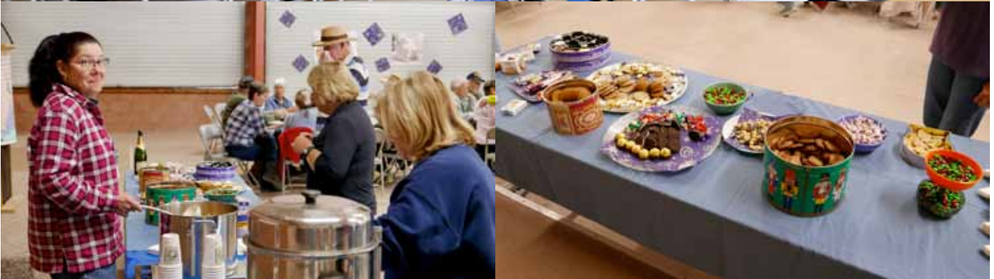
We all had a great time together with tasty treats and a trivia contest.